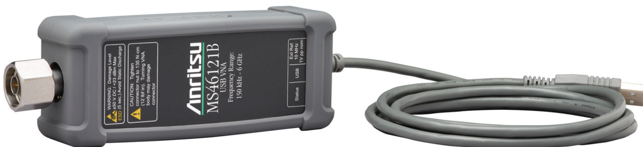
MS46121B ShockLine 1-Port USB VNA