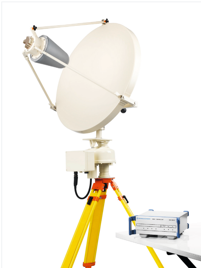
R&S®AC008 with R&S®RD016 antenna rotator and R&S®GB016 control unit.