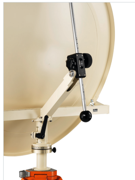
R&S®AC008 with R&S®AC008-AZ high-resolution elevation adjustment upgrade kit.